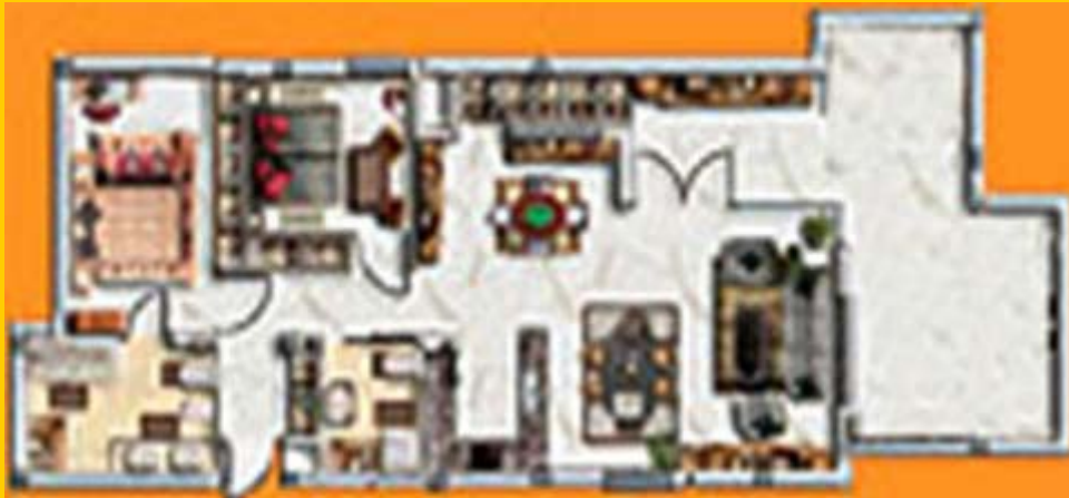
2 Bed Terraced Apartment