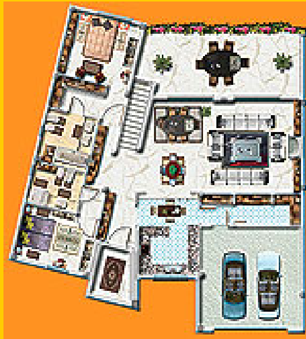
2 Bed Bungalow