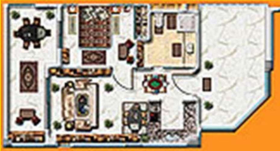
1 Bed Apartment